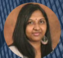
Devoshum Moodley-Veera Experienced Public Sector Executive South African Government